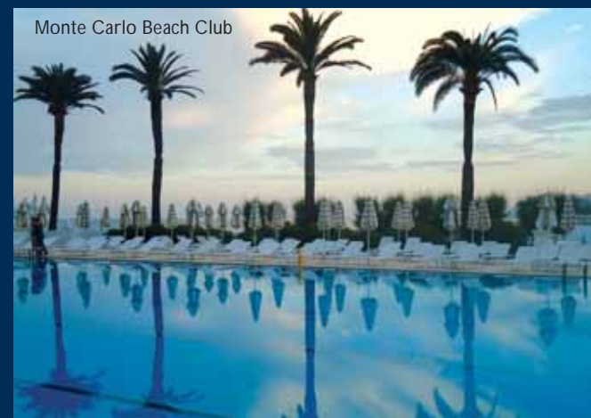
Monte Carlo Beach Club

If all this sounds appealing to you, prepare your engines for the Abu Dhabi Grand Prix in early November. This new stop on the racing tour has quickly become a fan favorite.