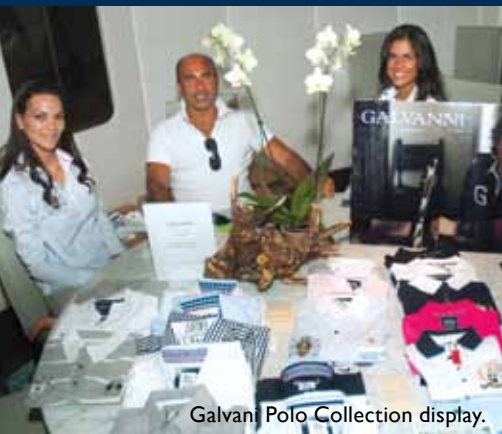
Galvanni Polo Collection display.