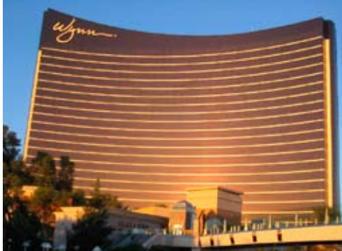
Wynn Las Vegas