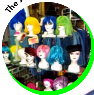
The Attic Props

Oh, I forgot to mention the BITCH CLUB which was founded in Vegas by a Vegas babe and stands for Beautiful, Intelligent, Tenacious, Charming & Haute. During club meetings the members get to bitch . It's actually a powerful networking group. No men allowed!