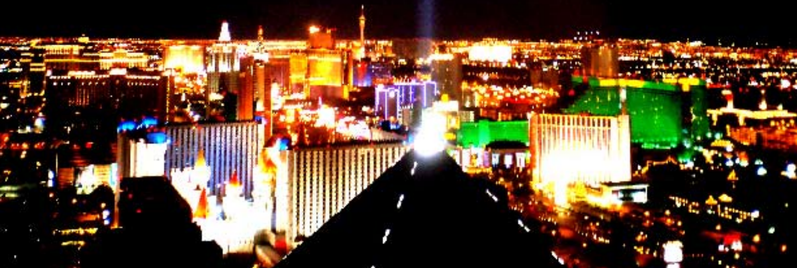
View from Hell

F rom Heaven to Hell in seconds...in VEGAS!