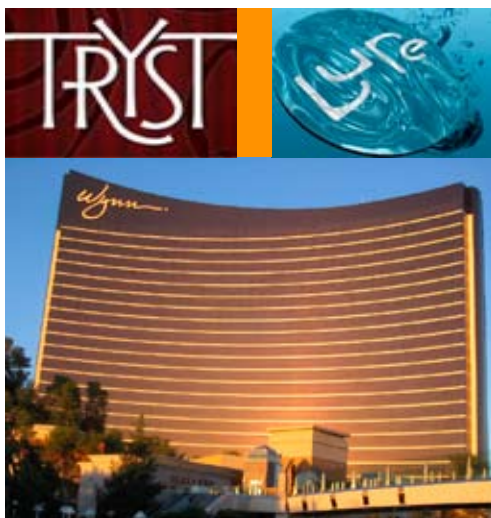
Wynn Las Vegas

Vegas seems to be maturing from theme-park driven madness to the newer, sleeker incarnation by Steve Wynn of his latest namesake Wynn Las Vegas ( WynnLasVegas.com ). No pirate ships, erupting volcanoes or Venetian canals. Here he will Lure you into his lounge and then allows you to have a Tryst at his disco. But as always, "What happens in Vegas, stays in Vegas."