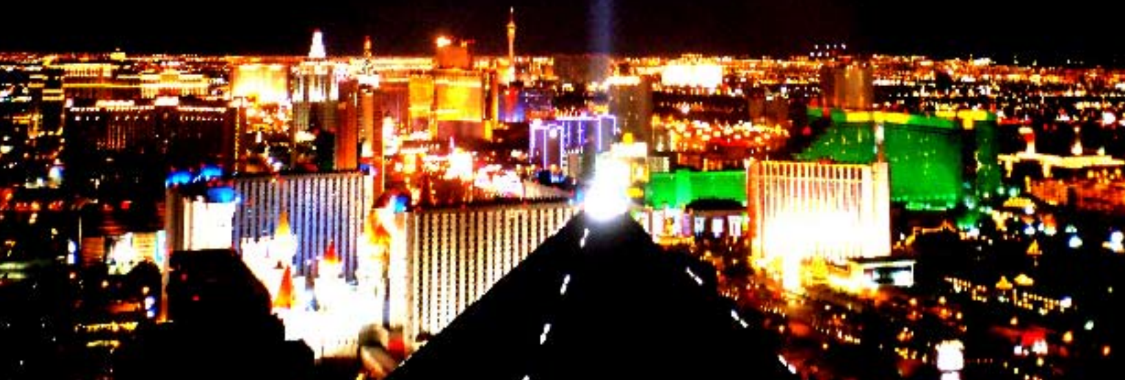
View from Hell

F rom Heaven to Hell in seconds...in VEGAS!