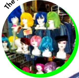
The Attic Props

Oh, I forgot to mention the BITCH CLUB which was founded in Vegas by a Vegas babe and stands for Beautiful, Intelligent, Tenacious, Charming & Haute. During club meetings the members get to bitch . It's actually a powerful networking group. No men allowed!